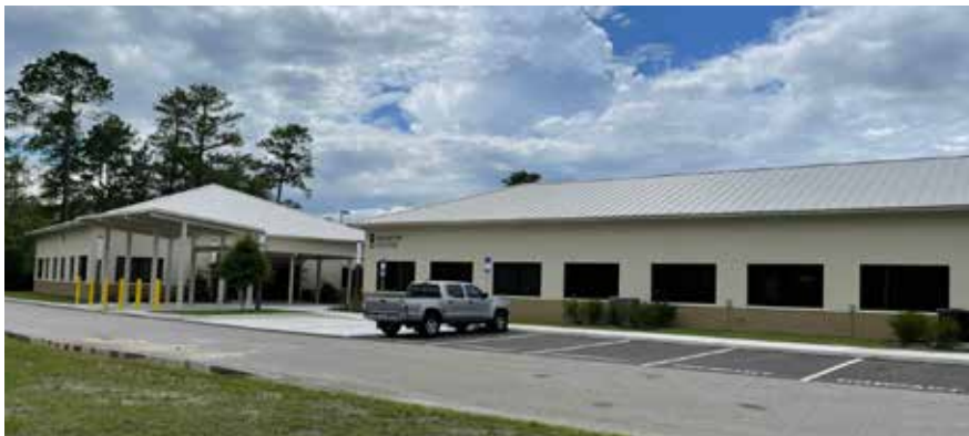
Completed Parish Office and Ministry Buildings

As of June 30, 2022, the Parish Life Center loan balance was $1,804,464. The Administration & Ministry Buildings loan balance was $2,047,638. In the first quarter of 2023, the two loans will be combined.